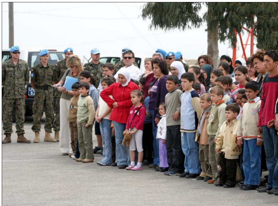
Syrian children from orphanages together with Polish soldiers