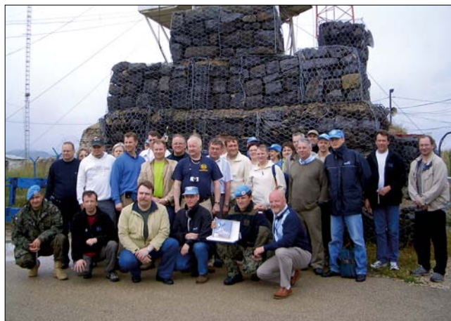
Visit of Finland ex-peacekeepers to POLBATT Area. Enjoyed nostalgic time at each position (25 th Apr 2006)