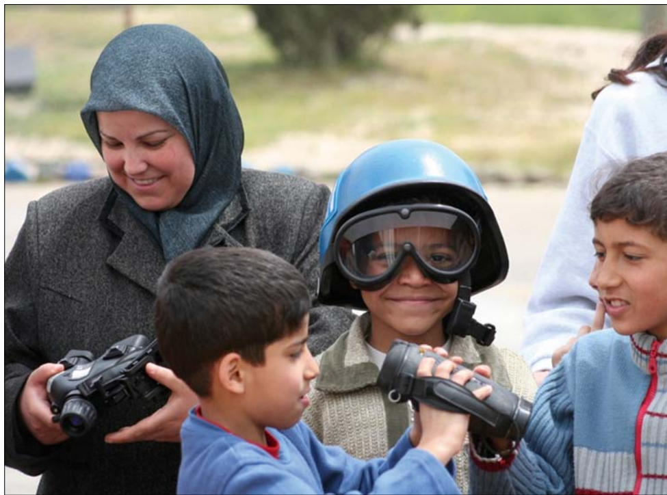
Syrian teacher and children on Posn 60