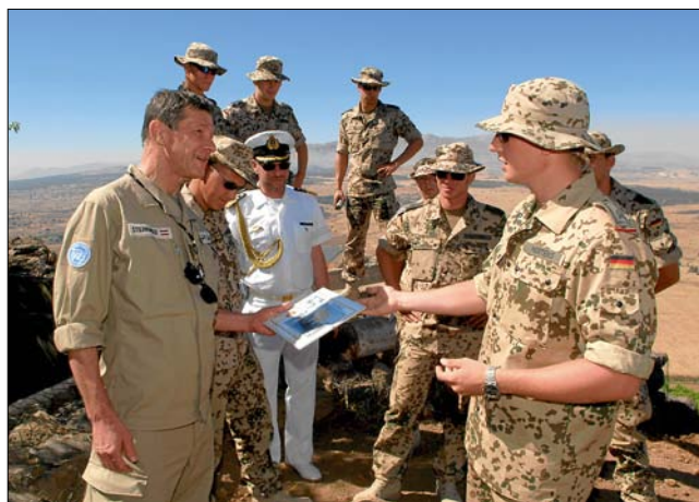
Visit of cadets from Germany, fact finding UNDOF and UNTSO activities. Visited OP51, CZ, Posn 22 and Mt. Bental (12 th Jun 2006)