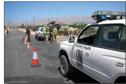
MP at work

MP members on one side and on the other side we have close liaison with the GILO's from Alpha Gate! Our duties are to patrol in the