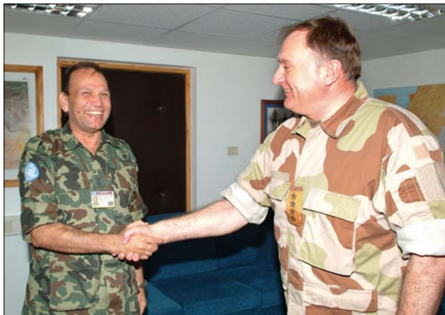
Visit of Gen Sverre Diesen, Chief of Defense Norway. Met with the FC and encouraged Norwegian and other OGG UNMOs (19 th Apr 2006)