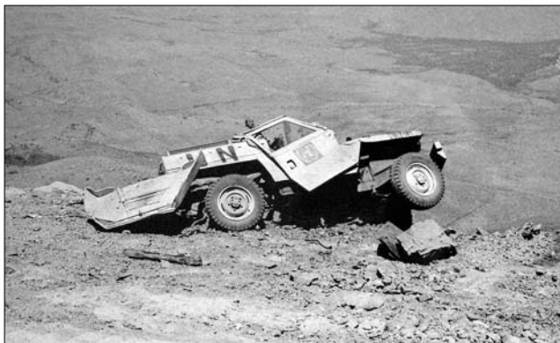
The Land Rover after the accident