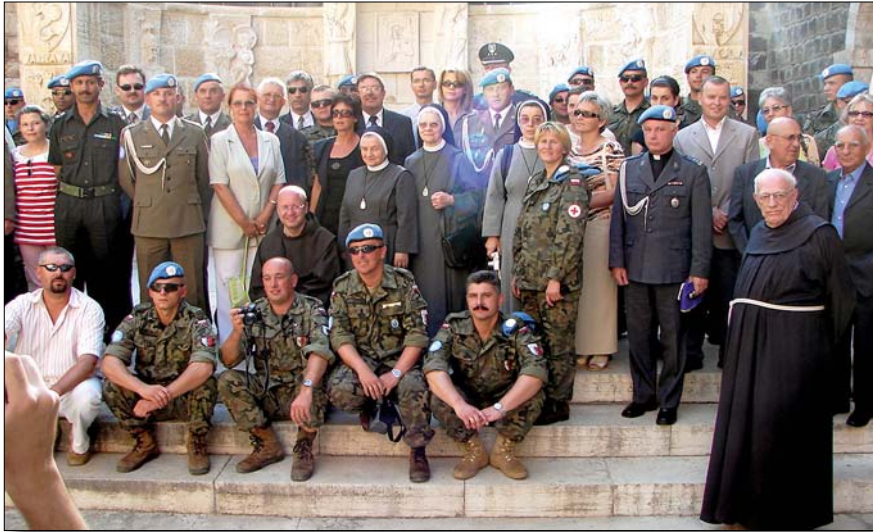
Participants of 3 rd of May anniversary ceremony

The 3 rd of May is a special date in the history of Poland. On this day in 1791 Sejm, Poland's highest legislative authority instituted the Constitution. This was only the second time in the world after the United States that this type of act took place and the first time in Europe.