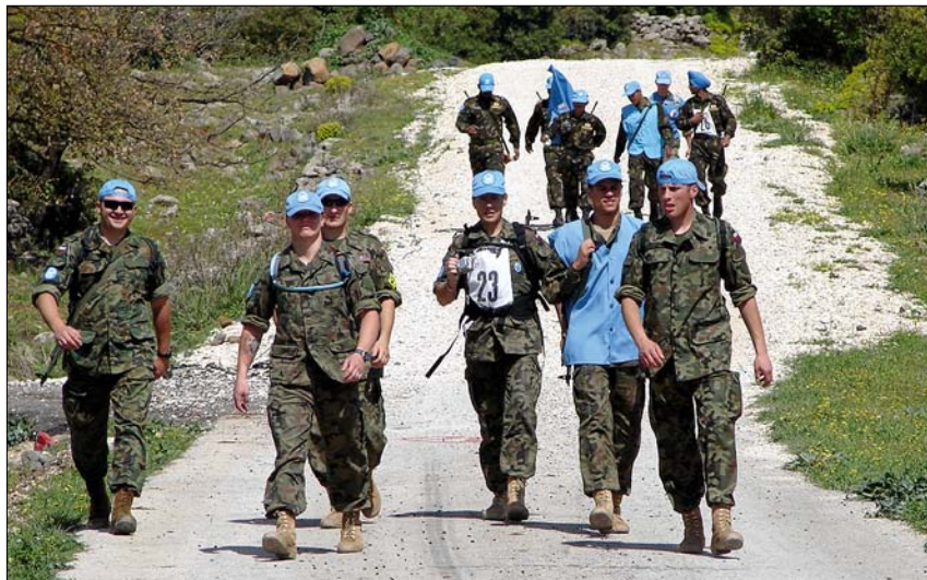
POLBATT and INDCON soldiers during Coyote March