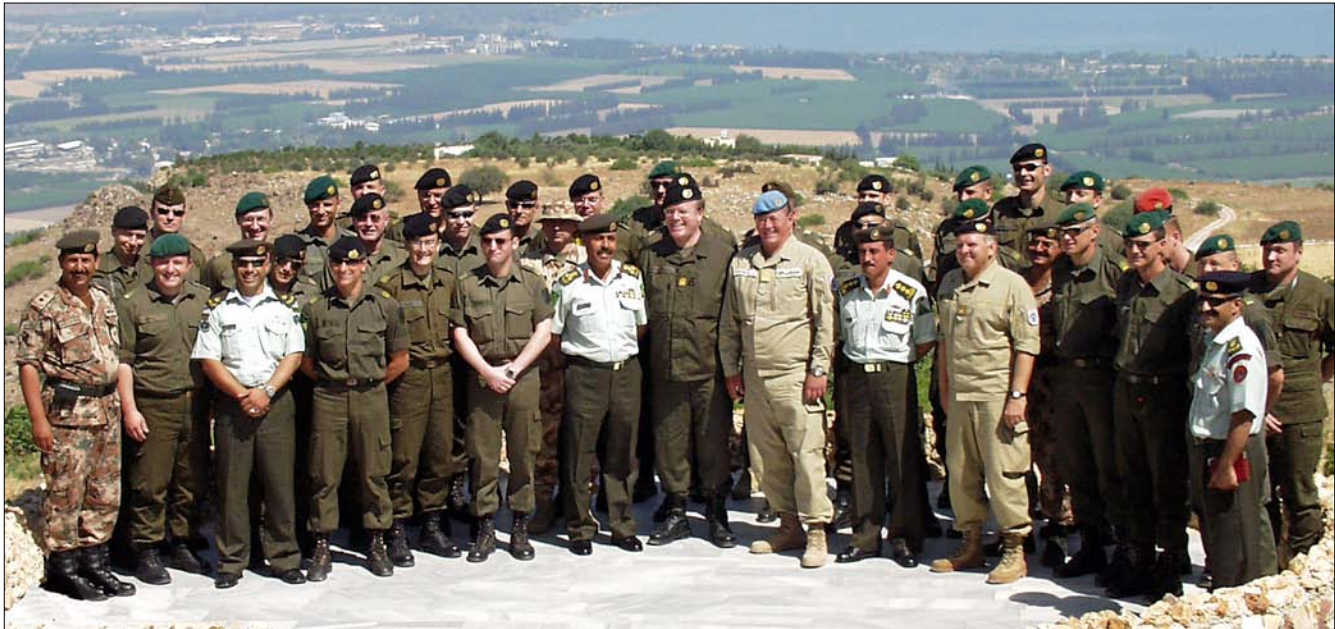
After a Briefing near the border triangle Jordan – Syria – Israel

Members of the 17 th General Staff Officers Course tour Jordan, Syria, UNDOF, Lebanon and UNIFIL in a unique journey