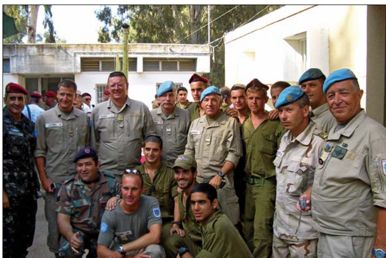
'Freedom Jumpers' before the exciting event

With this in mind the unique role and contribution that UNPKOs can make has been discussed recently at UN sub-platforms with regard to supporting and facilitating sporting activities aimed at furthering peace building efforts. On a positive note, UN officials have been informed of the interest of leading sport bodies, including International Olympic Committee (IOC) and 'Federation Internationale de Football Association' (FIFA), to support