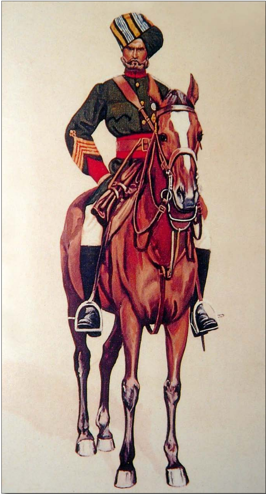
Daffadar (Sgt) of the Poona Horse 1884

his surrender. The European turned out to be Col TE Lawrence, the fabled 'Lawrence of Arabia'; It is not known if 'El Aurens' was amused by the encounter. At 1015hrs on the morning of 1 st Oct 1918, the Regiment