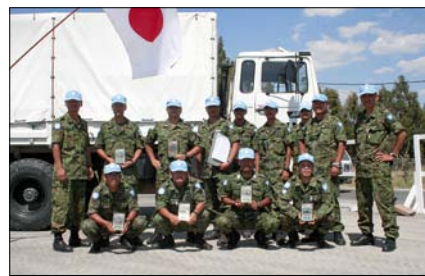
J-CON - The overall winning team

This consequence brought good results – solidarity, self confidence, a feeling of achievement and especially, awareness of safety driving to J-CON members. As part